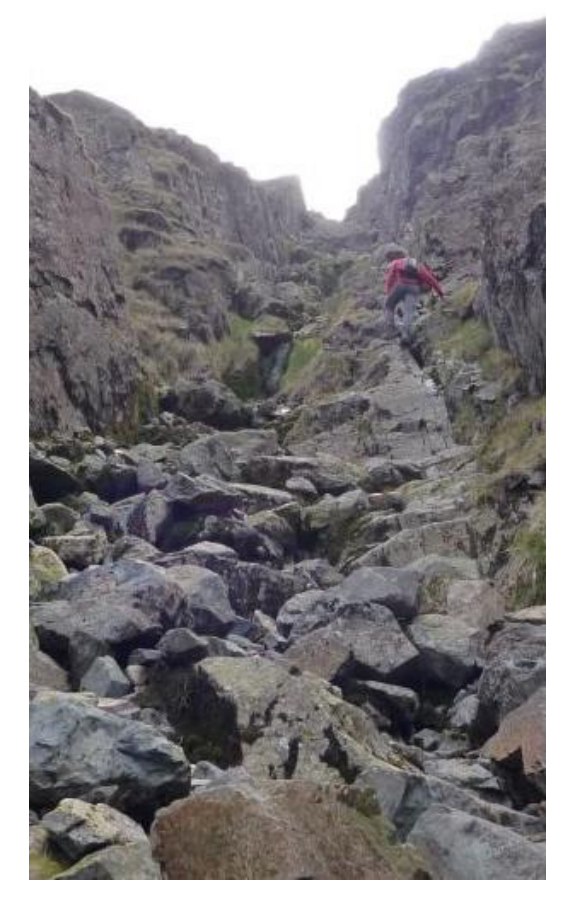
Route up from Foxes Tarn

was a massively steep ascent up to Scafell. Here I realised I had lost my watch; presumably it was knocked off the quick-release strap when I fell. Along the ridge to Slight Side where there the route dropped off the ridge and turned back towards the start. The group I was following turned left off the ridge. The race map warned of descending too soon in order to avoid crags, and I had a decision to make; should I follow the group, or follow my own instincts and continue further along the ridge before turning off.